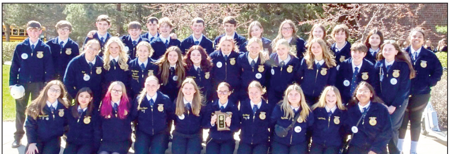
Crookston FFA competed at the Minnesota State FFA Convention. Thirty-seven Crookston FFA students competed in

nine Minnesota FFA State Career Development Events.