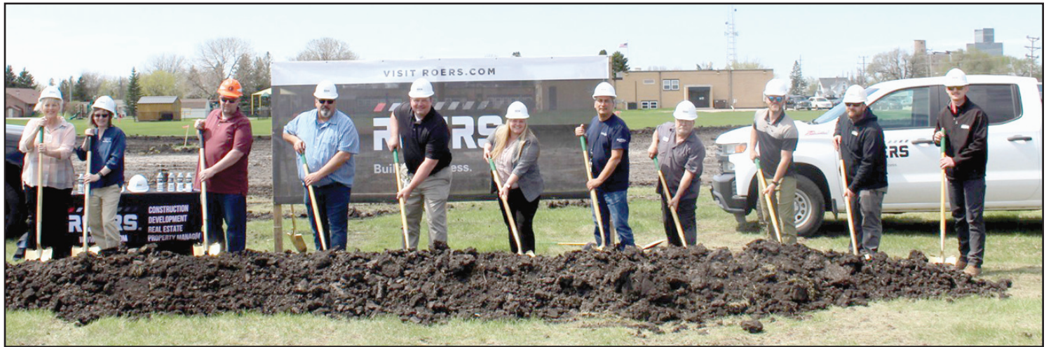
Tri-Valley Transportation Programs broke ground this month for its new bus storage facility located along Guthrie Street in Crookston. Joining Tri-Valley at the groundbreaking were

The groundbreaking event was attended by representatives from Roers, the Minnesota Department of Transportation and Tri-Valley, underscoring the collaborative effort behind this development.